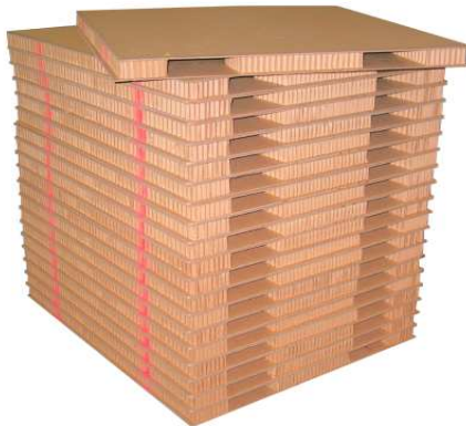
960 PALLETS / 48' TRAILER 1040 PALLETS / 53' TRAILER (NOTE: Red markings on sides denote forklift target area for side entry.)

When shipping full truckload, IEI's Power Pallet™ is an excellent alternative to one-way disposable wooden pallets.